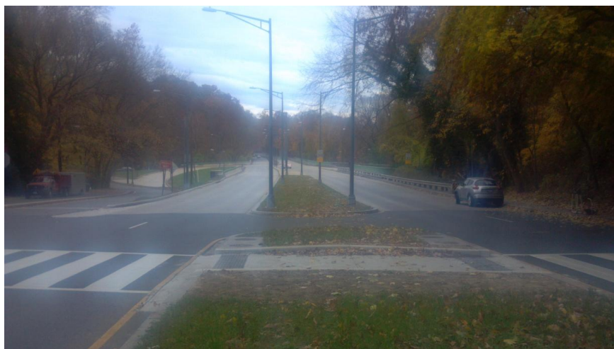
View Eastbound from Outside Block