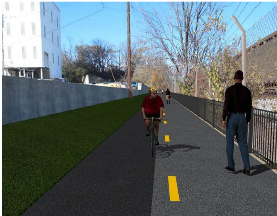
Proposed Metropolitan Branch Trail

For Additional Trail Information Please see www.metbranchtrail.com