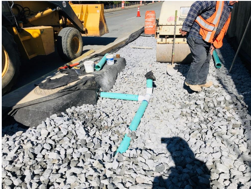
Underdrain Installation near the South end of John McCormack