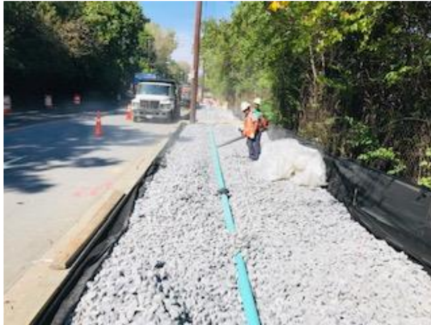
Underdrain Installation on the South end of John McCormack