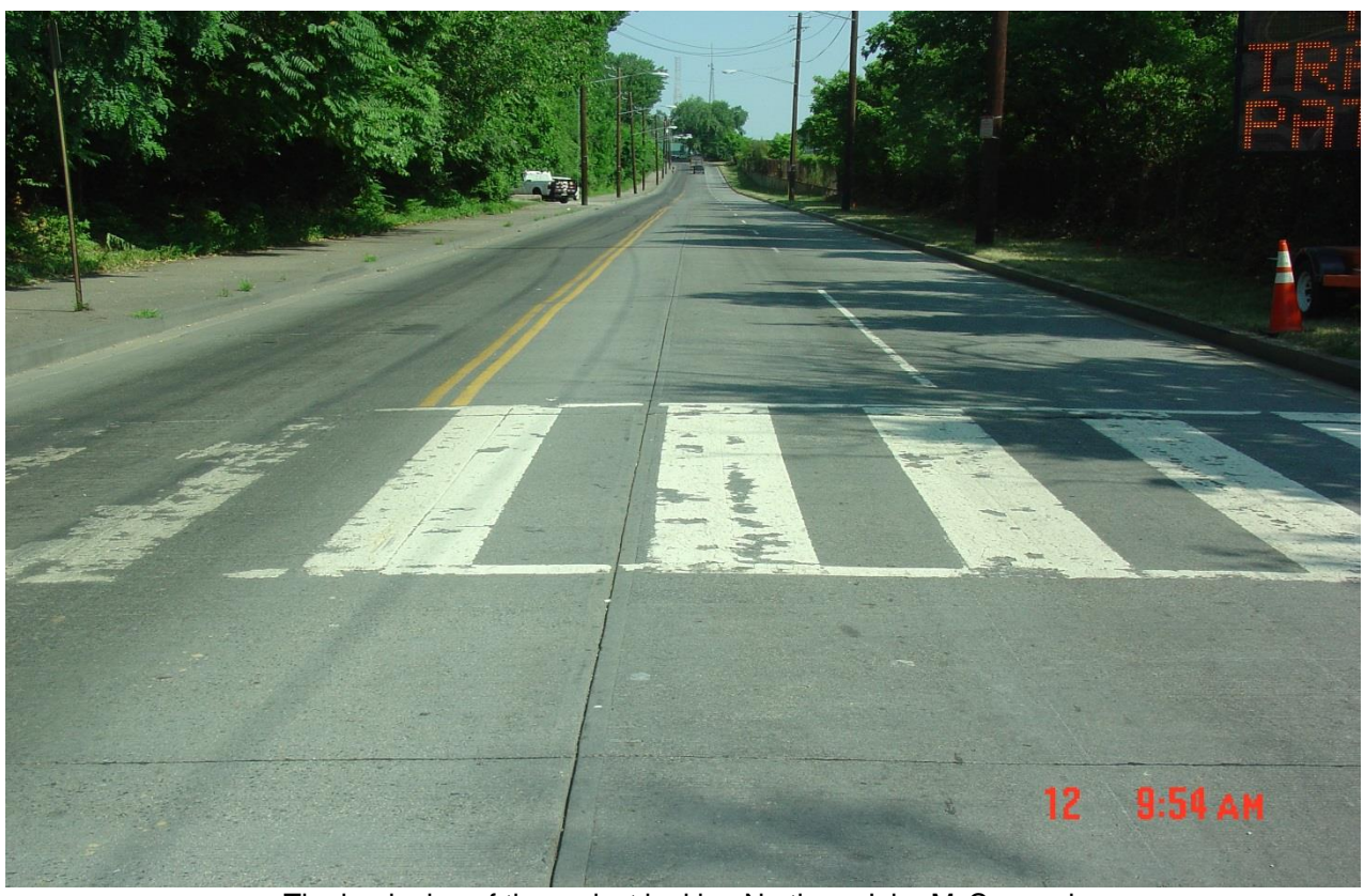
The beginning of the project looking North on John McCormack