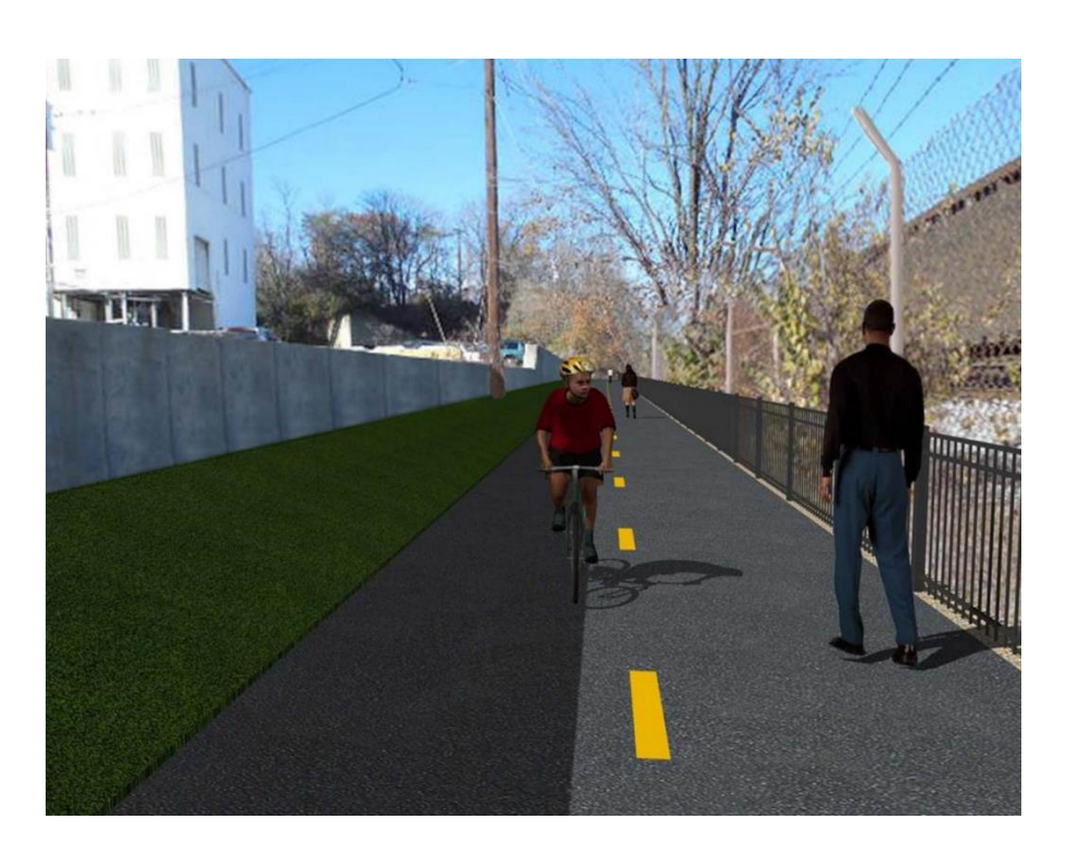
Proposed Metropolitan Branch Trail

Project Website: <a href="www.metbranchtrail-forttotten.com">www.metbranchtrail-forttotten.com</a> For Additional Trail Information Please see <a href="www.metbranchtrail.com">www.metbranchtrail.com</a>