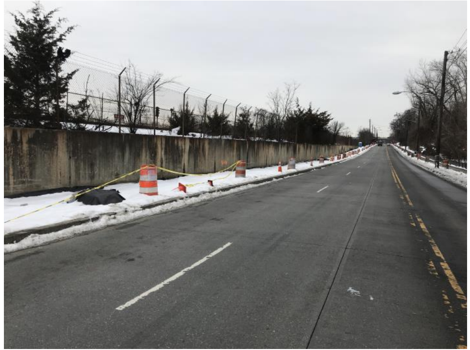
North end (At Bates Road) of Phase A looking South on John McCormack