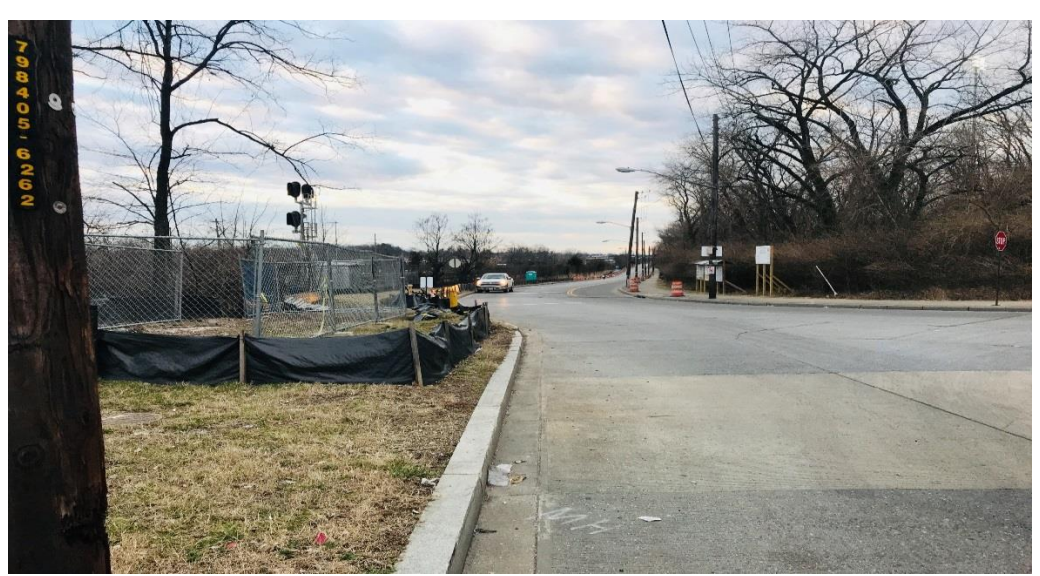
South end (DPW Driveway) of Phase D looking South on John McCormack