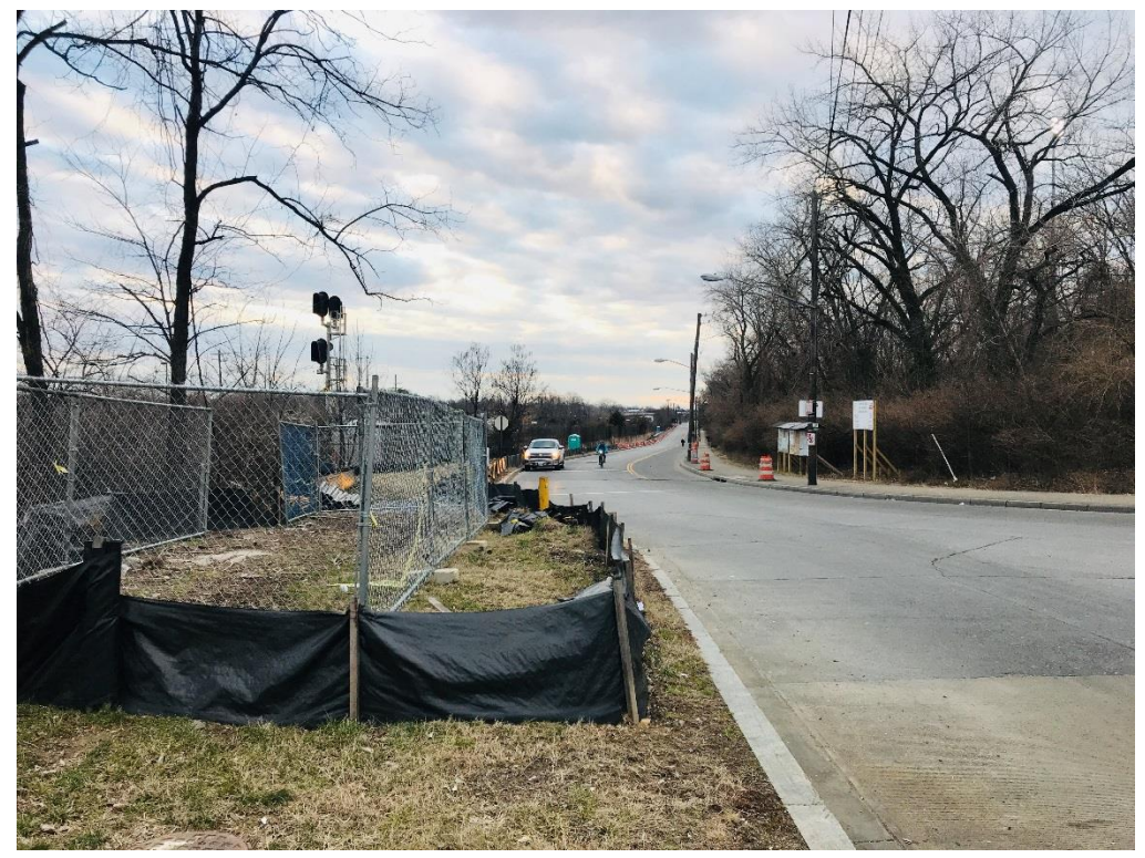
South end (DPW Driveway) of Phase D looking South on John McCormack