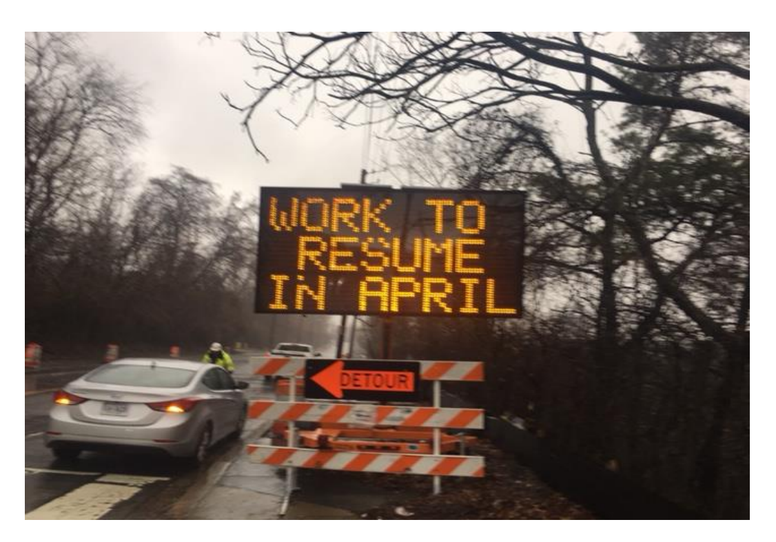
Contractor Changed the Verbal Message Sign – Winter Weather Impacts