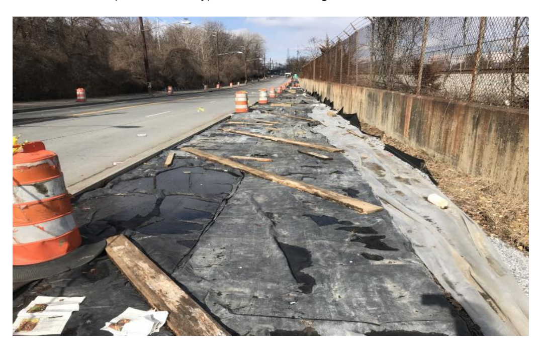
No Work - Looking North on John McCormack Drive NE