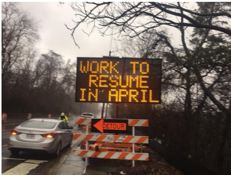
Construction work will Resume in April on John McCormack