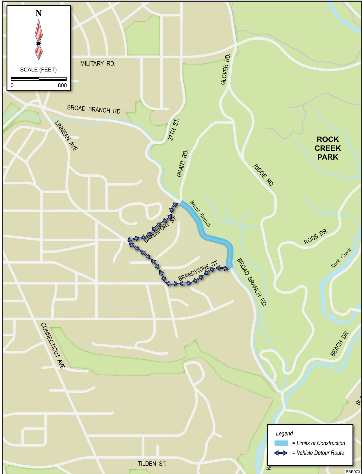
Figure E-3. Potential Detour – Location 3