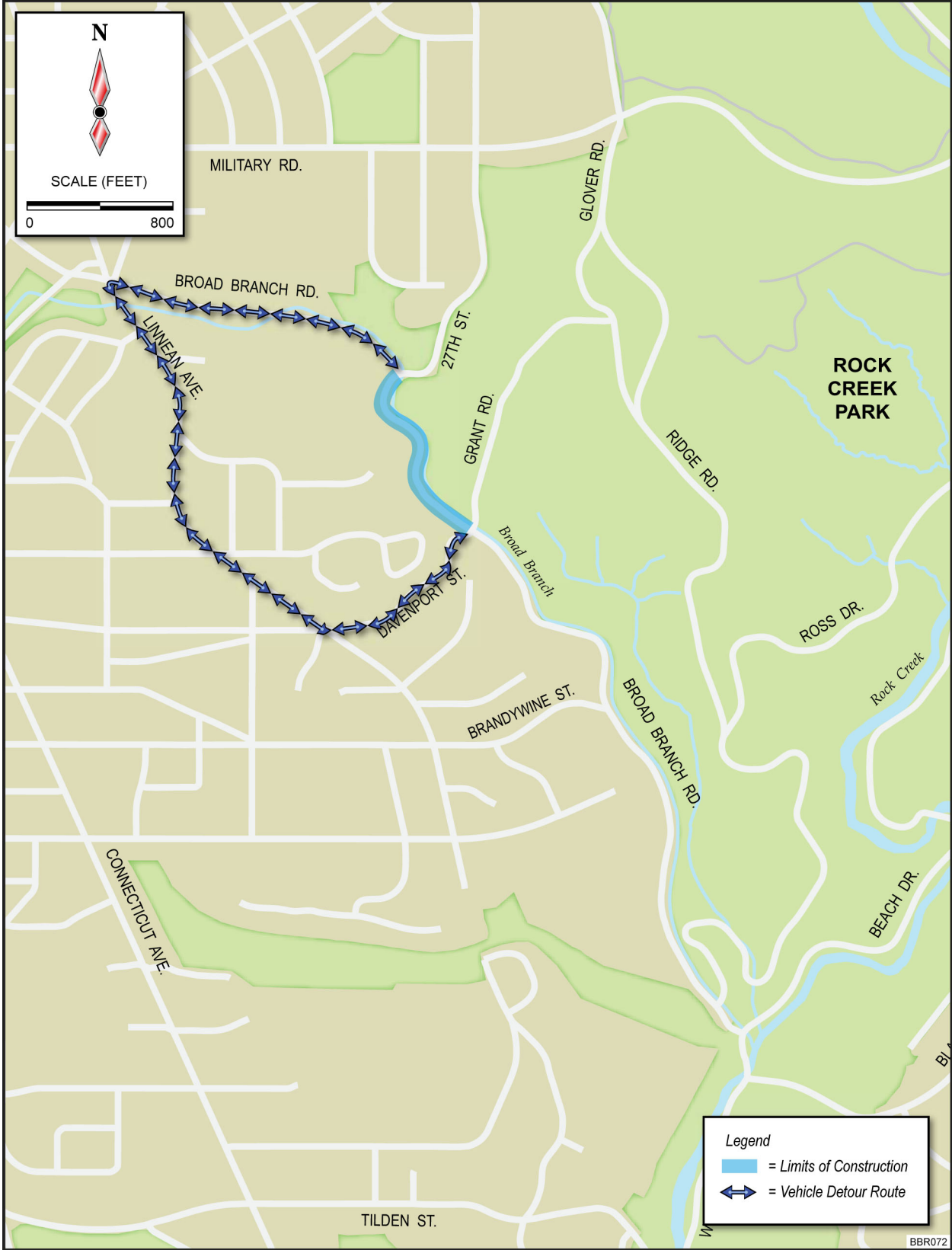
Figure E-2. Potential Detour – Location 2