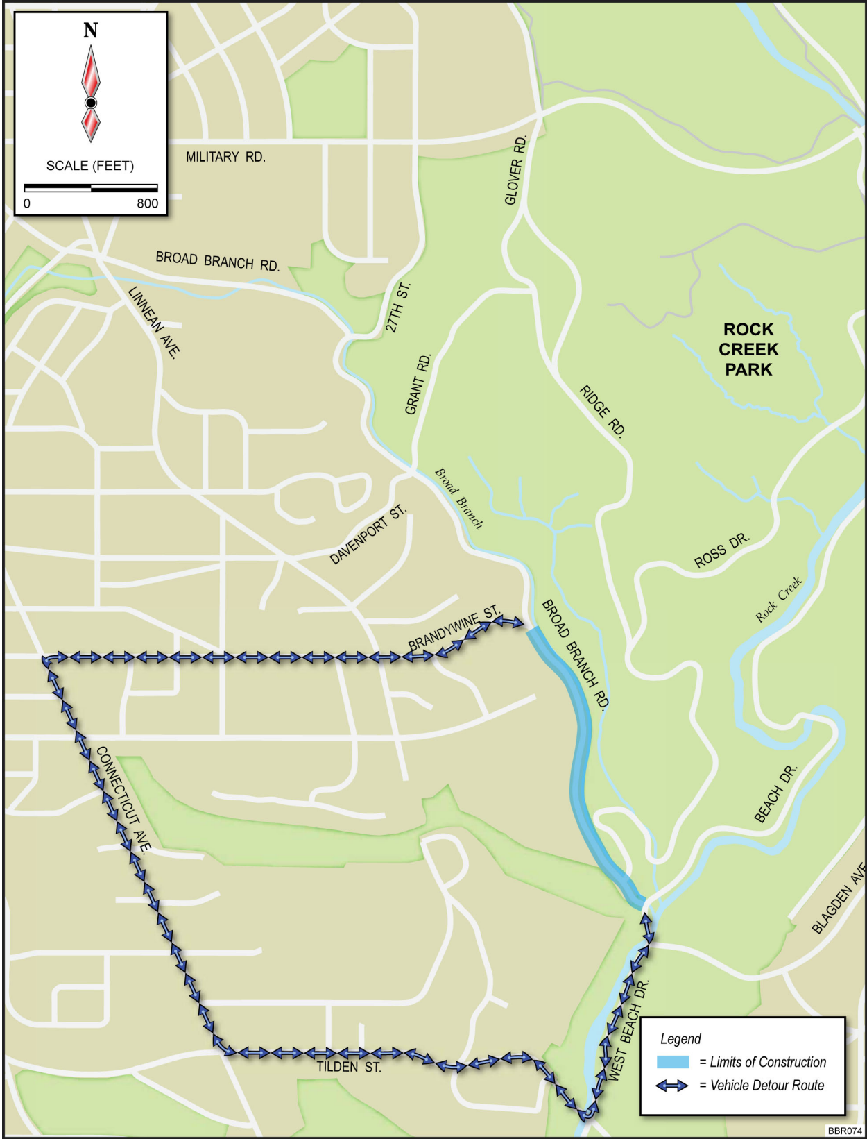
Figure E-4. Potential Detour – Location 4