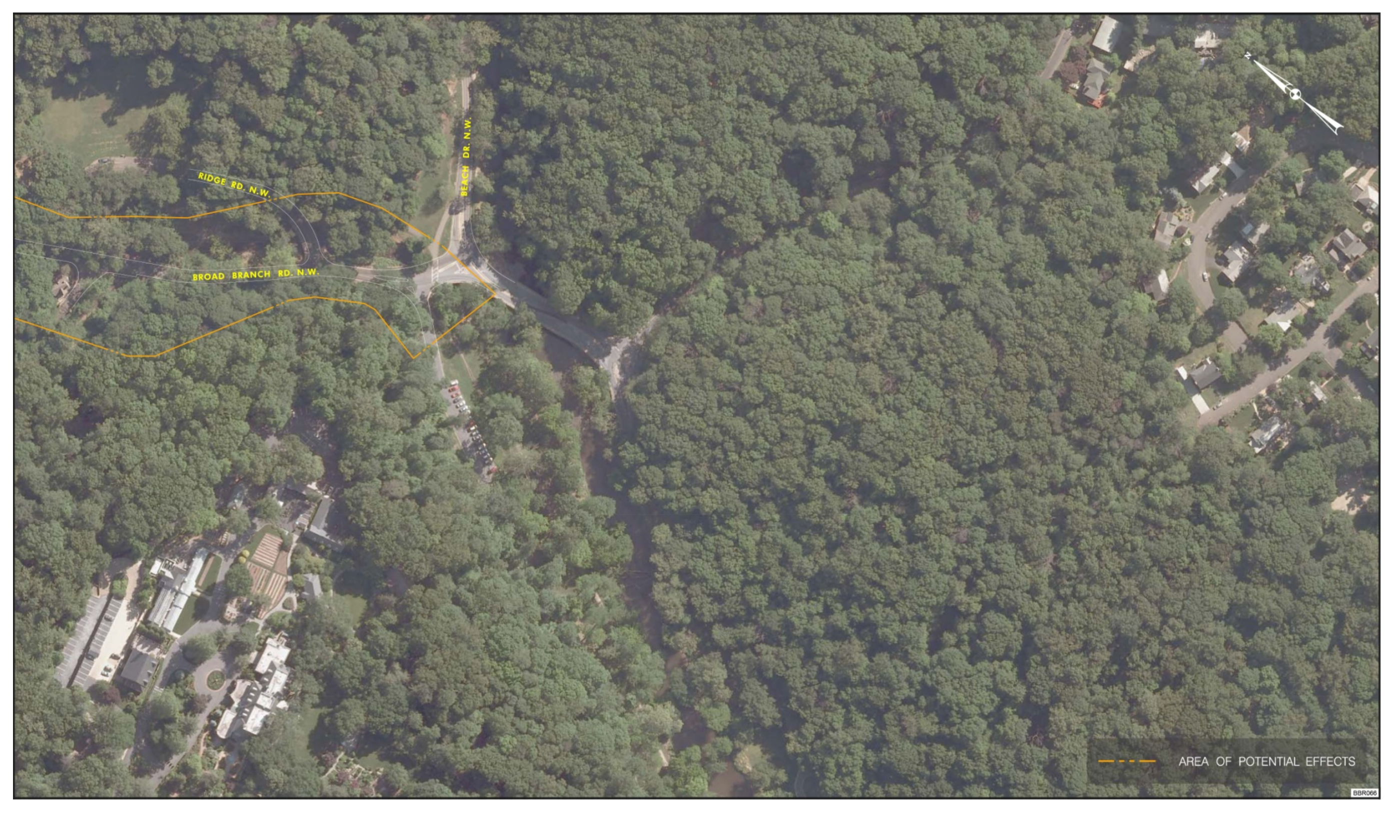
Figure D-1. Area of Potential Effects (Sheet 4 of 4)