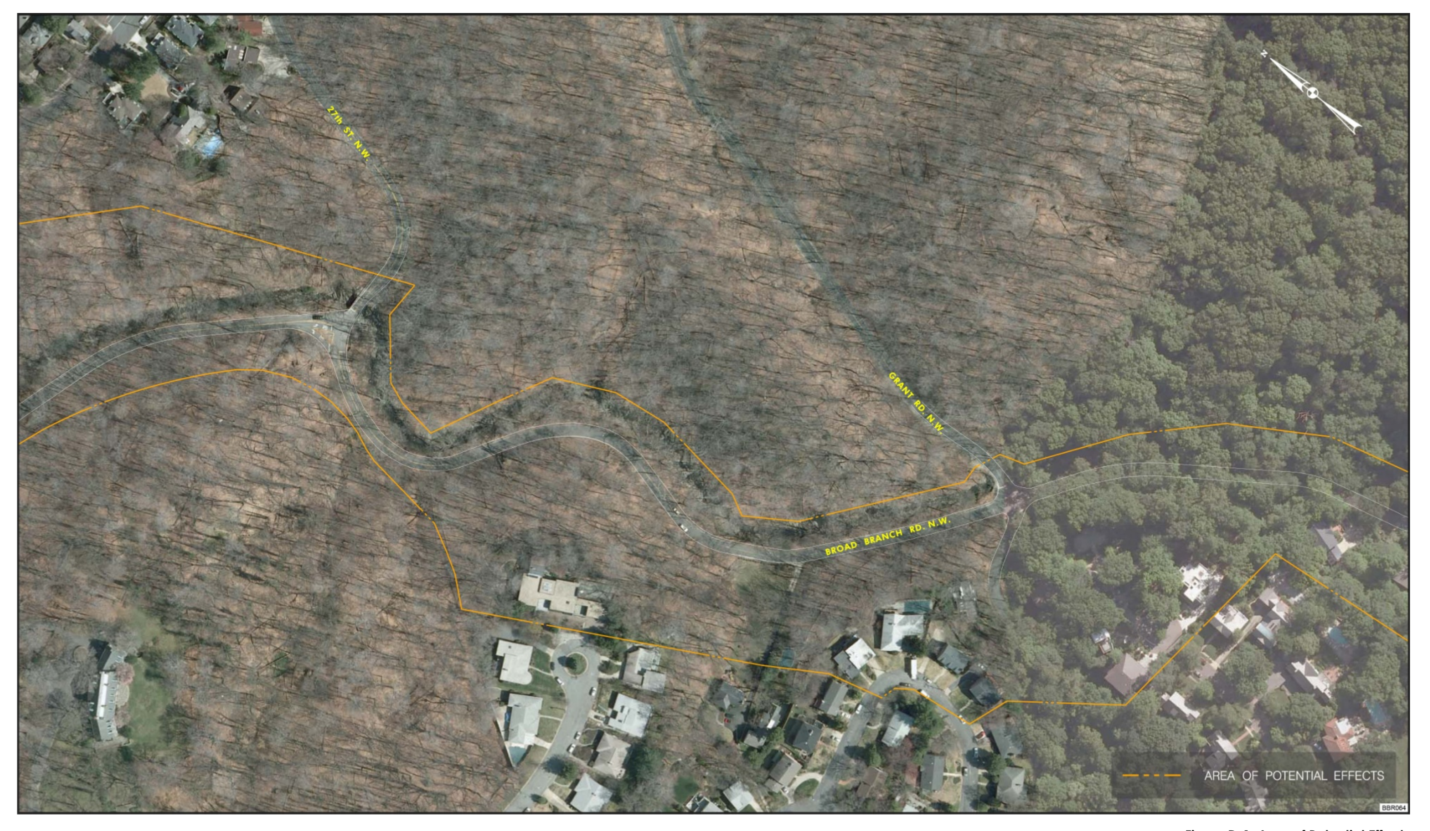
Figure D-1. Area of Potential Effects (Sheet 2 of 4)