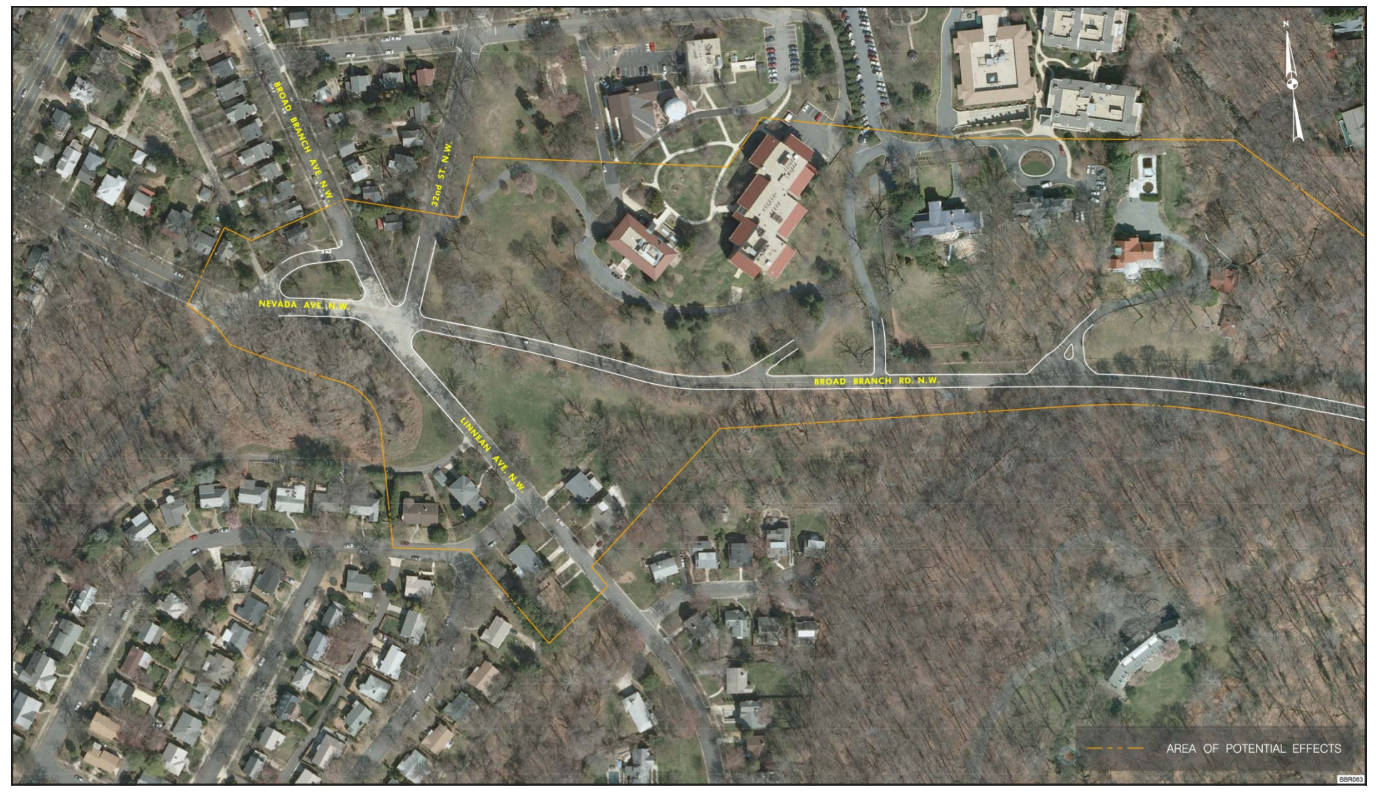
Figure D-1. Area of Potential Effects (Sheet 1 of 4)