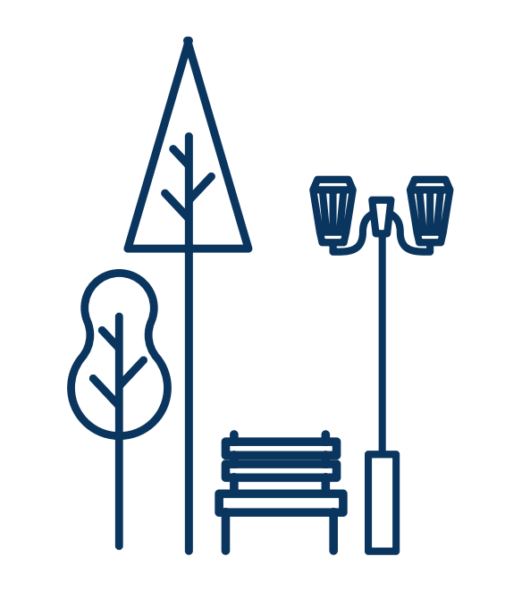
Safety and streetscape improvements