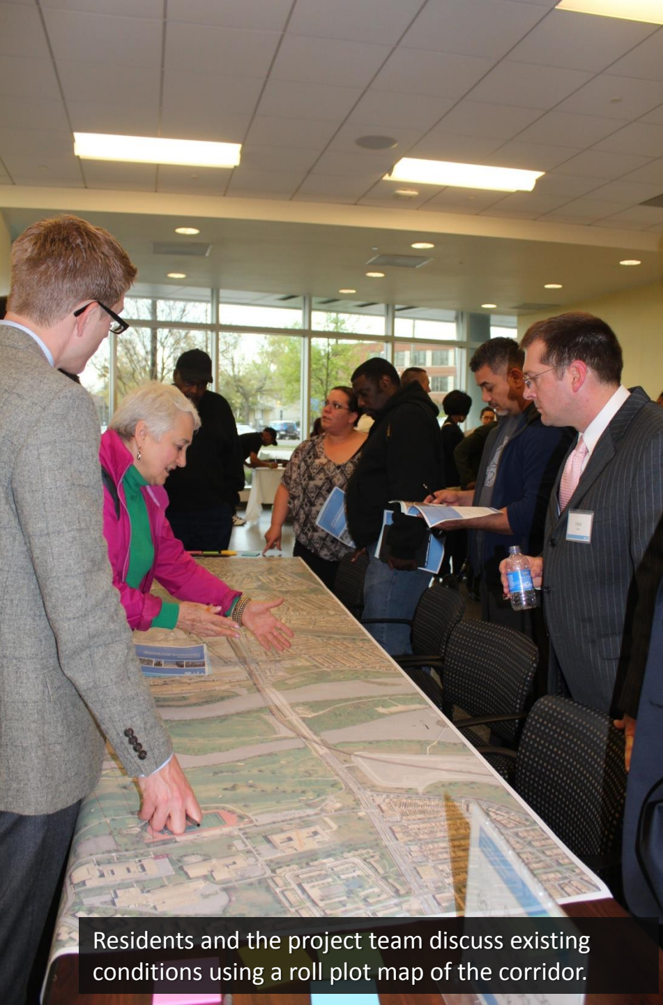
Residents and the project team discuss existing conditions using a roll plot map of the corridor.