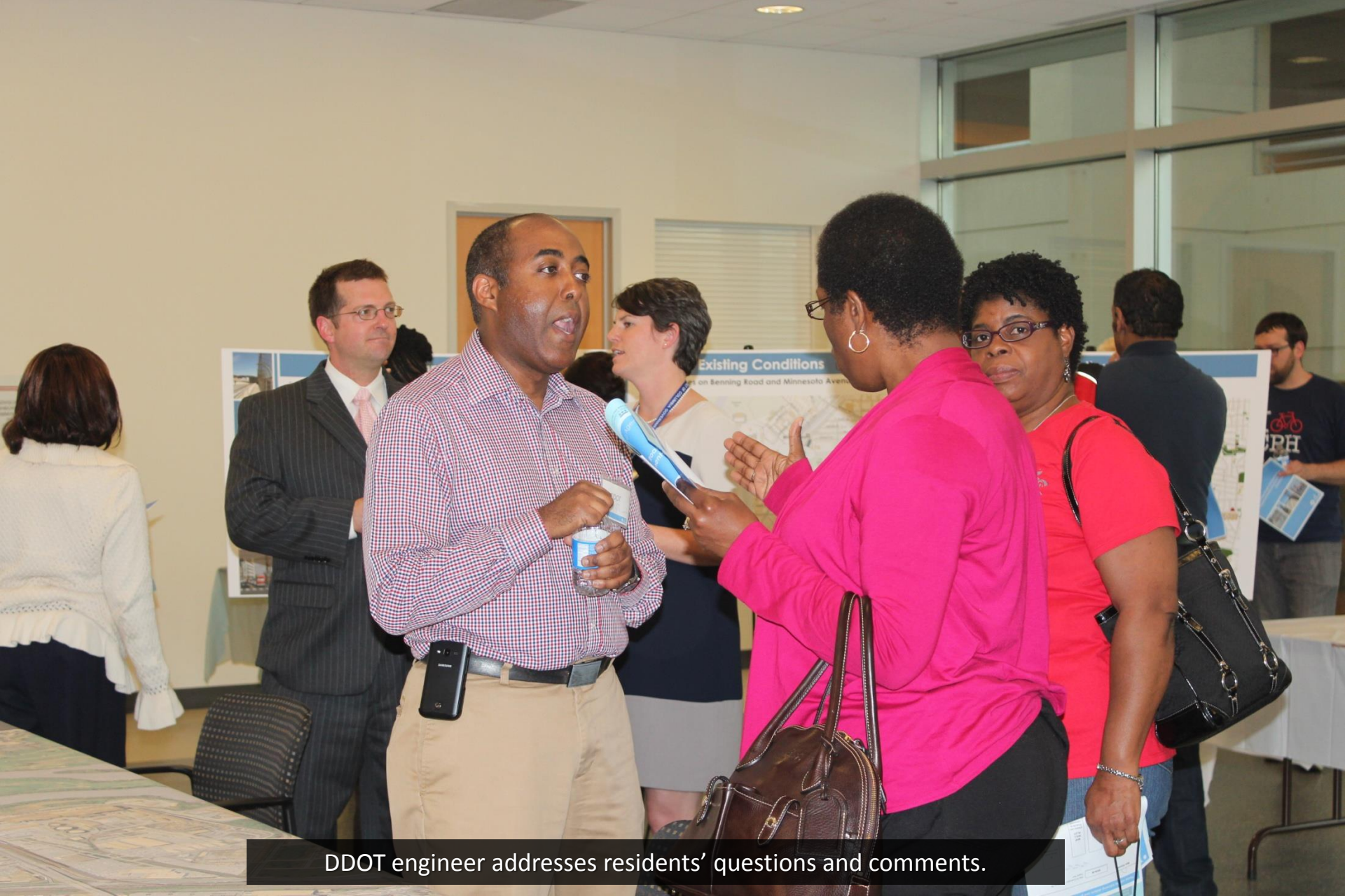
DDOT engineer addresses residents' questions and comments.