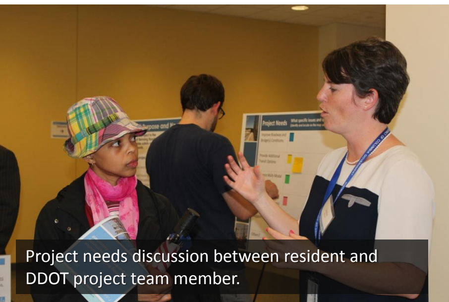
Project needs discussion between resident and DDOT project team member.