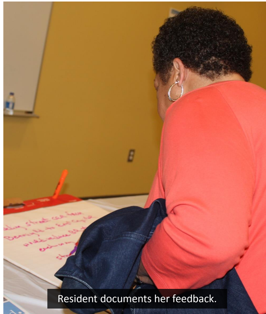
Resident documents her feedback.