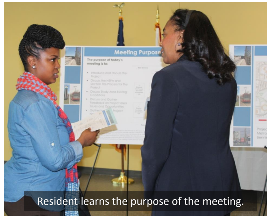
Resident learns the purpose of the meeting.