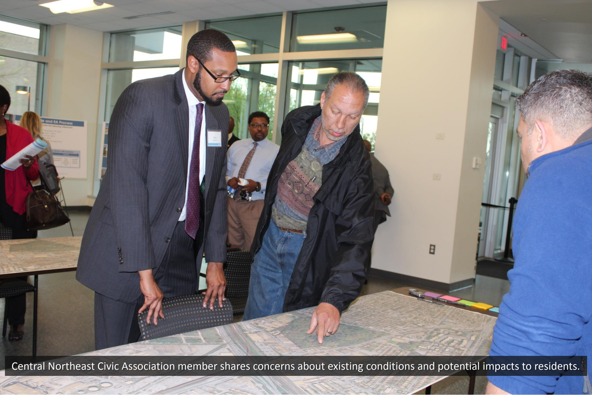
Central Northeast Civic Association member shares concerns about existing conditions and potential impacts to residents.