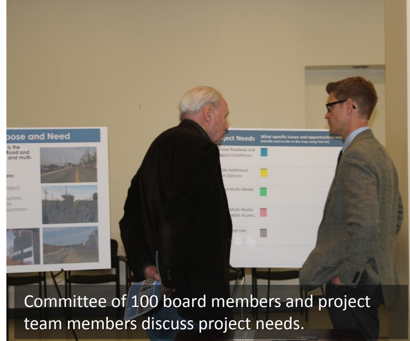
Committee of 100 board members and project team members discuss project needs.